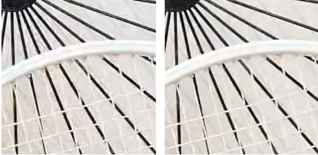
Fig. 2. Compressing the “bike” image at 0.25 bit/pixel. Left: Previous results presented in [2]. Right: current result.